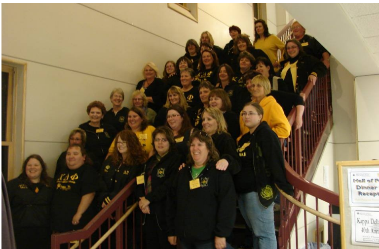
Kappa Mu celebrated 40 years of sisterhood. Above are the sisters that were in attendance. Pledges class from 1972-2012 were represented.

This last rush week we broke it up into two weeks. Our events included making T-shirts, Kappa Bingo and games night. We also co-sponsored a toga dance with the brothers of Kappa Delta Phi Mu chapter. We have done a homemade blanket raffle in the school colors for a fundraiser. We also are doing the Ruby Tuesday's Giveback Program. On September 14 th , the Sisters of Kappa Mu Chapter celebrated their 40 th anniversary. There were sisters there from almost every class going all the way back to our founding Sisters. During this event, we had a tribute to all sisters who have passed.